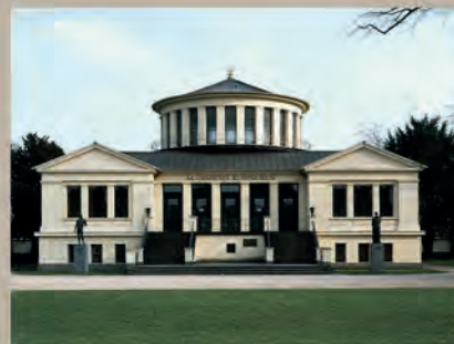
Akademisches Kunstmuseum Bonn Am Hofgarten 21 53113 Bonn